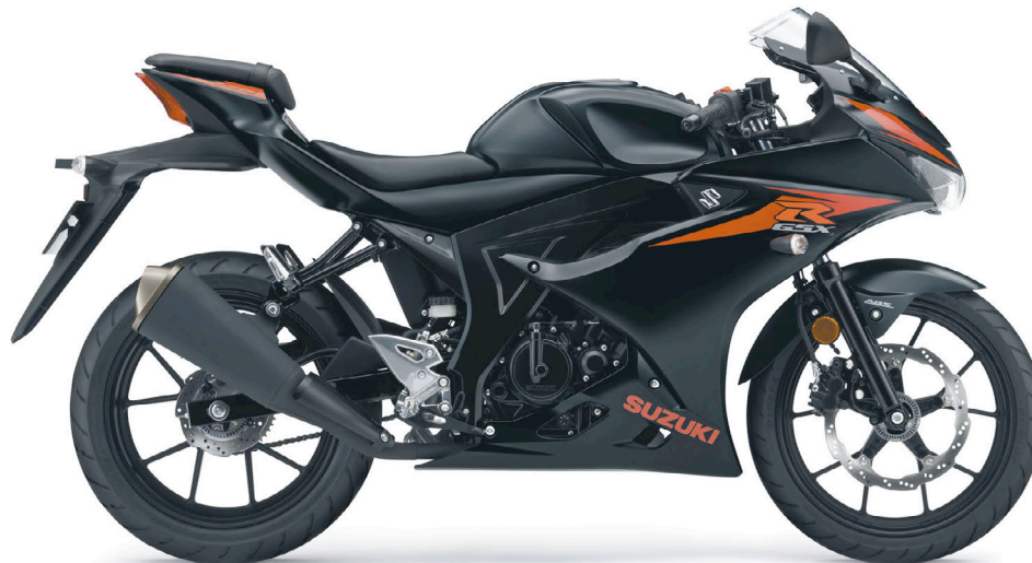
Solid Black 50% Gloss [291]