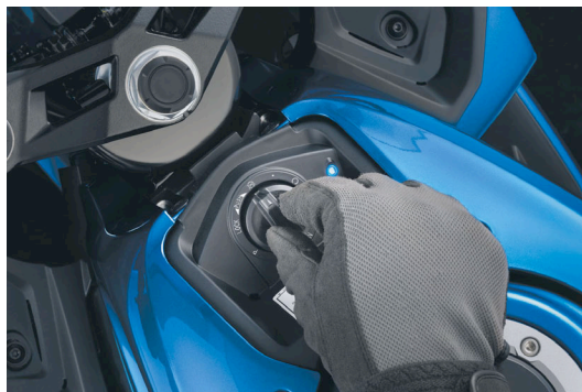
Key-less ignition system