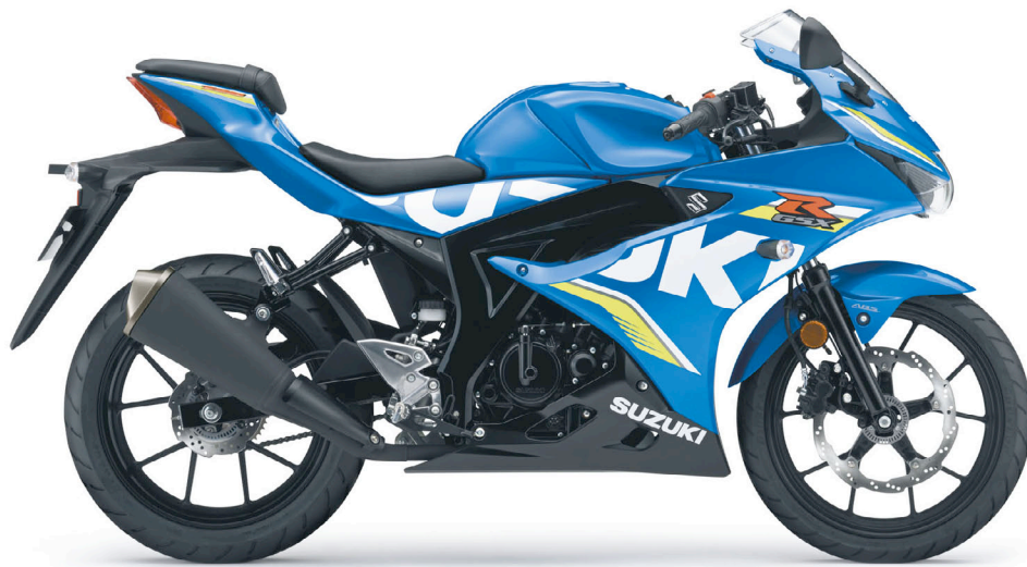
Metallic Triton Blue [YSF]