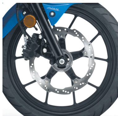
Petal brake disc and sporty wheel