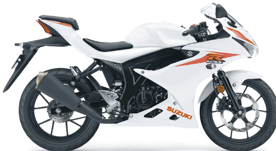
Brilliant White [YUH]