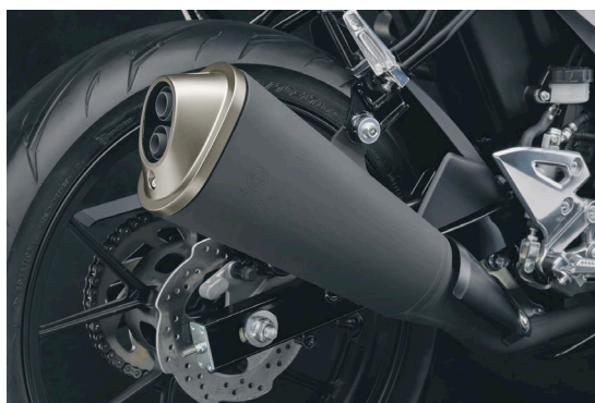
Dual exhaust muffler