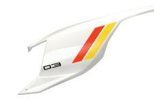
Heritage White II