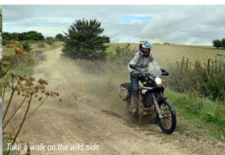
Take a walk on the wild side