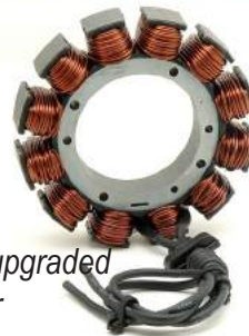
optional upgraded generator