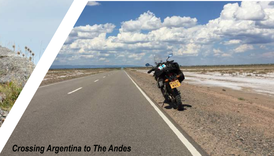
Crossing Argentina to The Andes