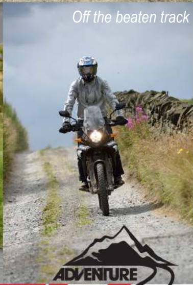
Off the beaten track