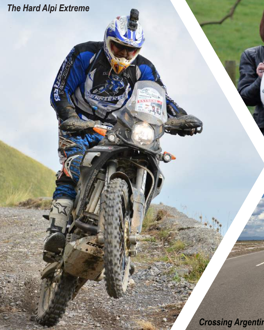
The Hard Alpi Extreme