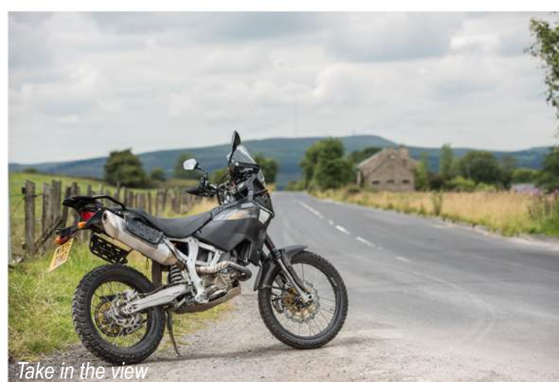
Take in the view