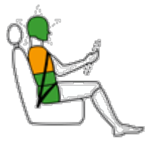
Conducente in impatto laterale