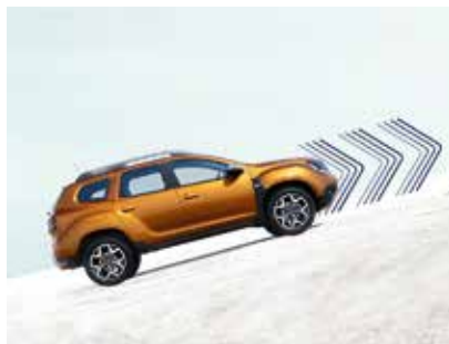
HILL START ASSIST

Hill Start Assist makes light work of the steepest slopes, while the Hill Descent Control* keeps you on top of your speed. And because your eyes can't be in two places at once. The multiview camera detects objects around you. Talk about smooth sailing.