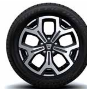
17" 'DIAMOND-CUT' ALLOY WHEEL