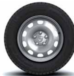
16" STEEL WHEEL