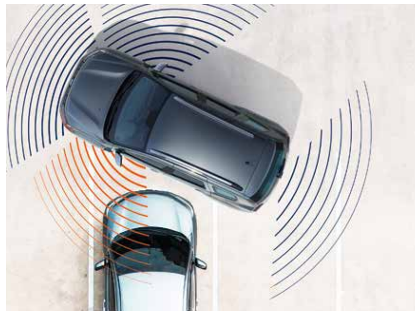
MULTIVIEW CAMERA ^