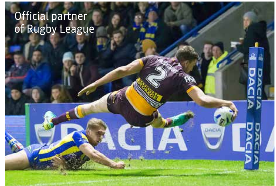
Official partner of Rugby League