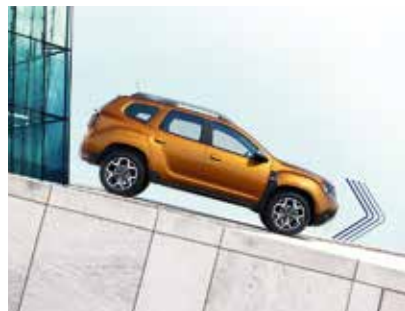
HILL DESCENT CONTROL*