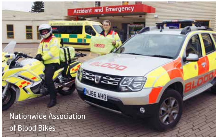
Nationwide Association of Blood Bikes

For us, going the extra mile doesn't stop at making great value cars. We take great pride in playing an active part in the community and giving back to communities throughout the UK. We support the life-saving work of the Nationwide Association of Blood Bikes . We get stuck in as the official partner of Rugby League . Now the proud sponsors of the Nation England Rugby League teams for Men, Women, Wheelchair and Youth. We also run Dacia Days , which are full of fun and games for our amazing Dacia drivers - keep an eye out for the next event! In the meantime, keep up with us on our Facebook page, Youtube Channel or Instagram.