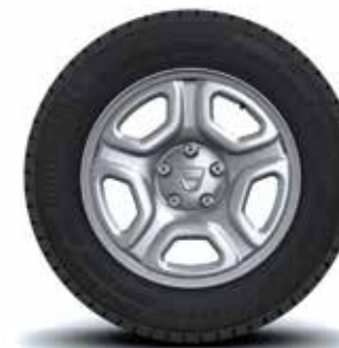
16" 'FIDJI STYLED' WHEEL