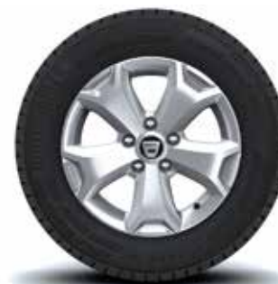
16" 'CYCLADE' ALLOY WHEEL