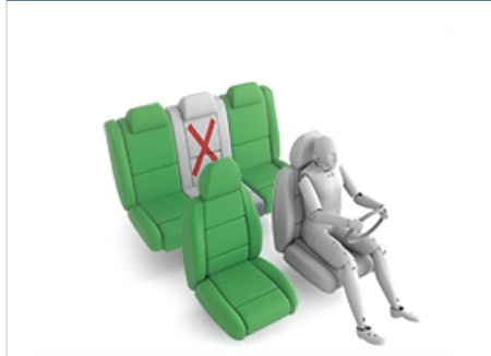
Maxi Cosi Cabriofix & EasyBase2 (Belt)