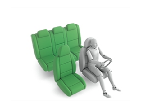
Römer King II LS (Belt)