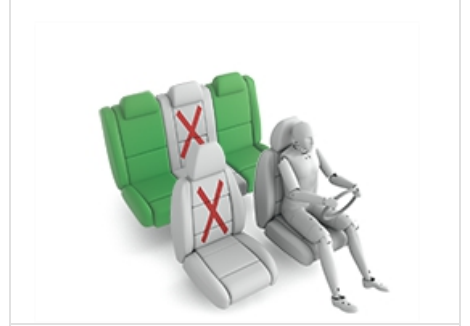
Römer Duo Plus (ISOFIX)