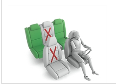
BeSafe iZi Kid X4 ISOfix (ISOFIX)