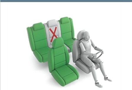
BeSafe iZi Combi X4 ISOfix (ISOFIX)