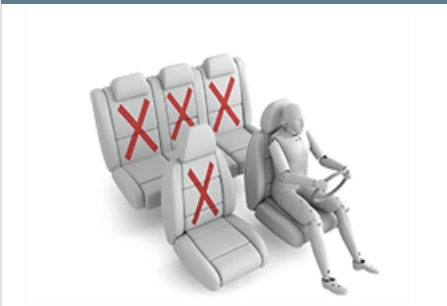
Britax Römer TriFix2 i-Size (i-Size)