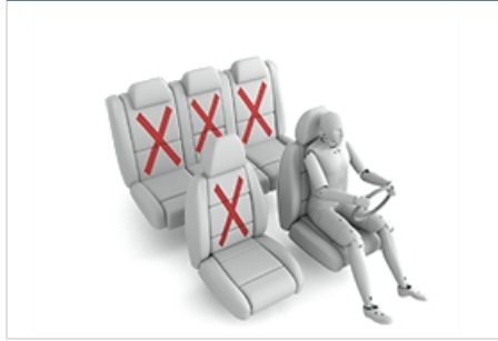
Maxi Cosi 2way Pearl & 2wayFix (i-Size)