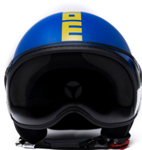
HERITAGE ALPINE BLU MATT 1001008003