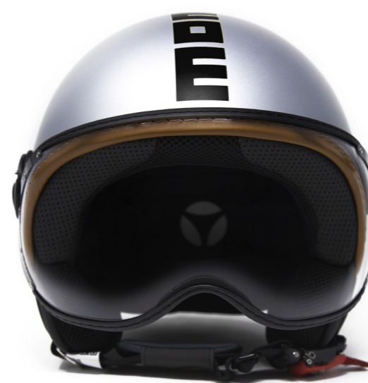
HERITAGE ALLUMINIUM GREY 1001008000