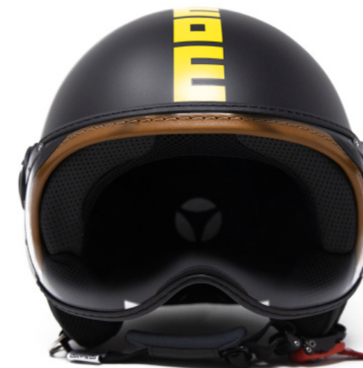
HERITAGE BLACK MATT 1001008001