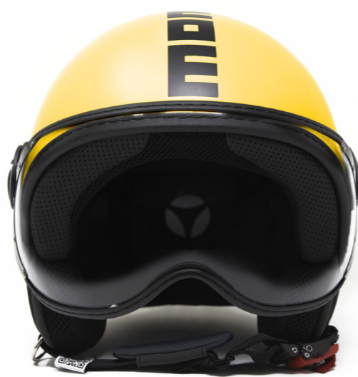
HERITAGE ALPINE YELLOW MATT 1001008002