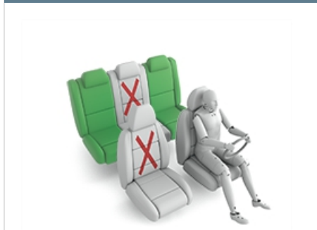
Maxi Cosi Cabriofix & EasyBase2 (Belt)