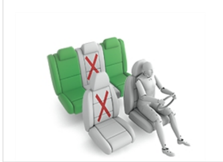
BeSafe iZi Kid X4 ISOfix (ISOFIX)