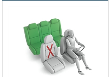
Römer King II LS (Belt)