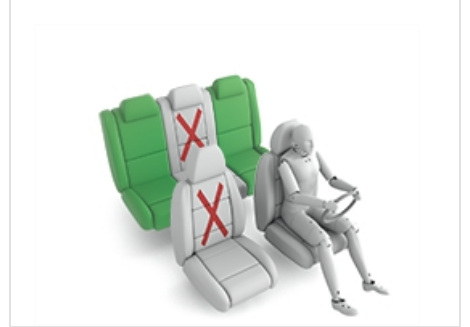
Römer Duo Plus (ISOFIX)