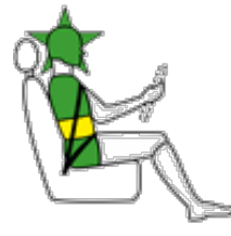
Conducente in impatto laterale