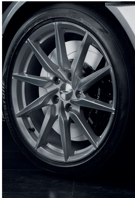
Winter Wheel and Tyre Kit