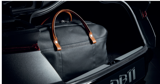
4-Piece Luggage Set