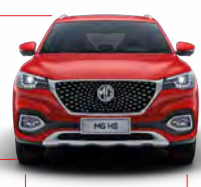
Front track 1573mm Width - including mirrors 2078mm