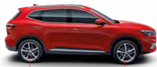
Wheelbase 2720mm Length 4574mm