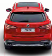
Rear track 1584mm Width - excluding mirrors 1876mm