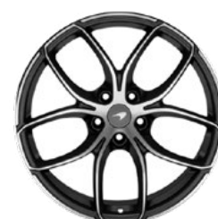
Satin Diamond cut finish

Super-Lightweight 10-Spoke forged alloy wheels