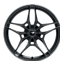
Satin Diamond cut finish

Lightweight 10-Spoke forged alloy wheels