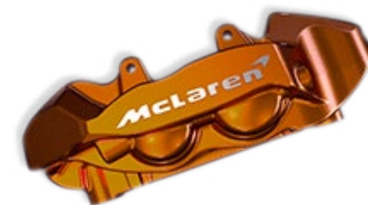
Azores with machined McLaren logo