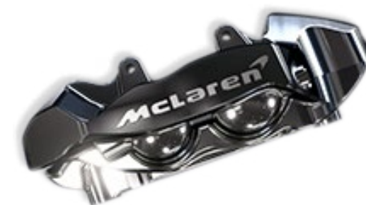
Polished with machined McLaren logo