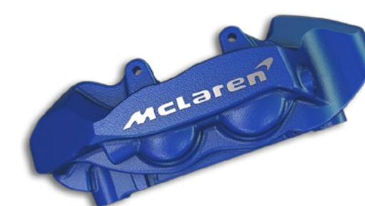
Azura Blue with silver machined McLaren Logo