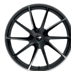
Satin Diamond cut finish