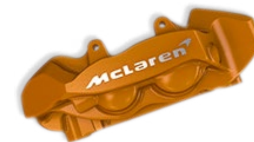
McLaren Orange with machined McLaren logo