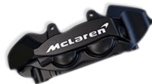
Black with printed McLaren logo