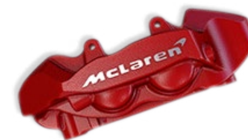
Red with machined McLaren logo