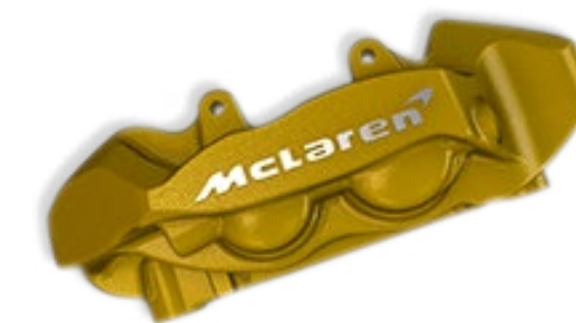
Yellow with machined McLaren logo