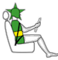
Conducente in impatto laterale