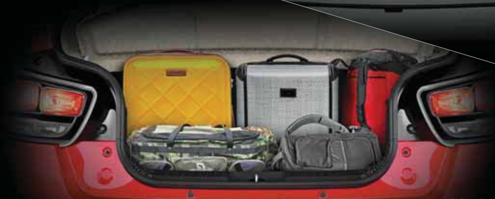
BOOT SPACE - 243 L (EXPANDABLE TO 473 L WITH FLAT-FLOOR)