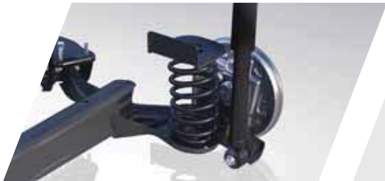
LONG TRAVEL SUSPENSION