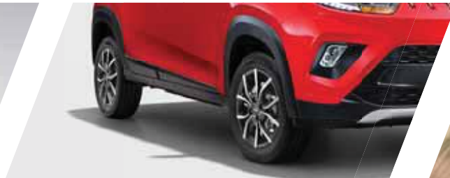
HIGH ANGLES OF APPROACH & DEPARTURE