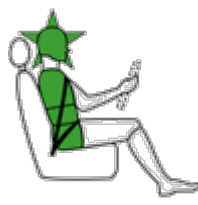
Conducente in impatto laterale