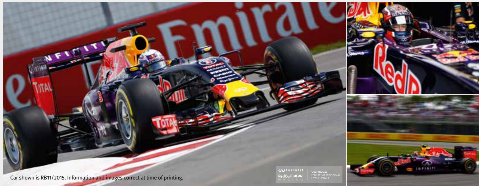
Car shown is RB11/2015. Information and images correct at time of printing.

The excitement builds. The pressure mounts. Emotions surge. This is how partnership feels when technology, ingenuity and passion fulfil their promise. This is Infiniti Red Bull Racing and you.