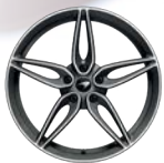
Diamond cut finish

Lightweight 10-Spoke forged alloy wheels