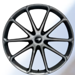
Diamond cut finish

Super-Lightweight 10-Spoke forged alloy wheels