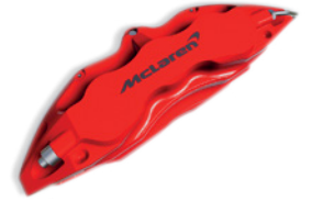
Red with black McLaren logo