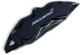
Black with silver McLaren logo