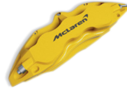
Yellow with black McLaren logo