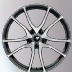
Diamond cut finish