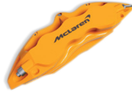
McLaren Orange with black McLaren logo